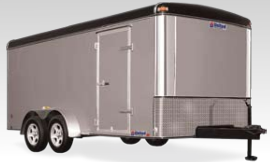
7' x 16' U-Series tag unit with optional bright aluminum front corners and aluminum Star wheels.