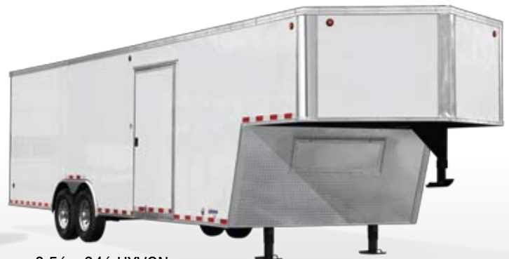
8.5' x 34' UXVGN