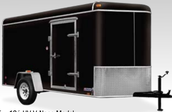
6' x 12' UV V-Nose Model