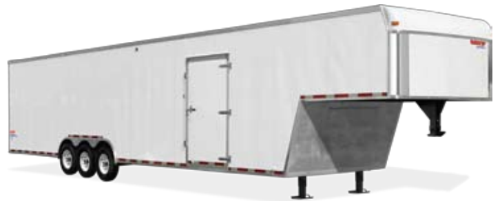
8.5' x 44' UXT Gooseneck Model