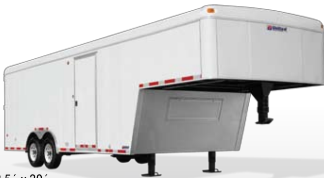
8.5' x 30' U-Series Gooseneck Model