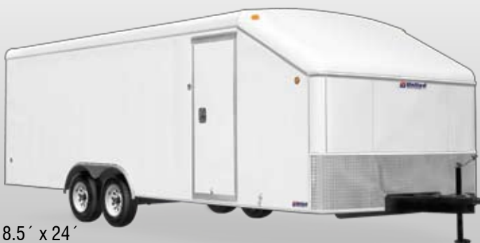
8.5' x 24' USN Slope-Nose Model