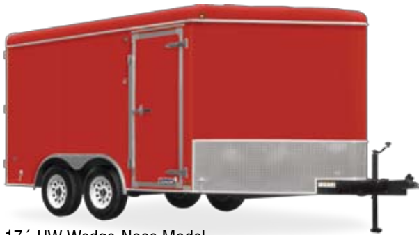
8.5' x 17' UW Wedge-Nose Model The wedge-nose models come with a 5' wedge.