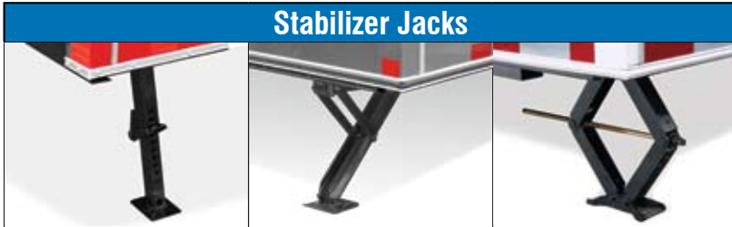
Light-Duty 1,000 lb. Fold Down

Custom cabinets are our specialty, and several standard cabinet layout options are also available.