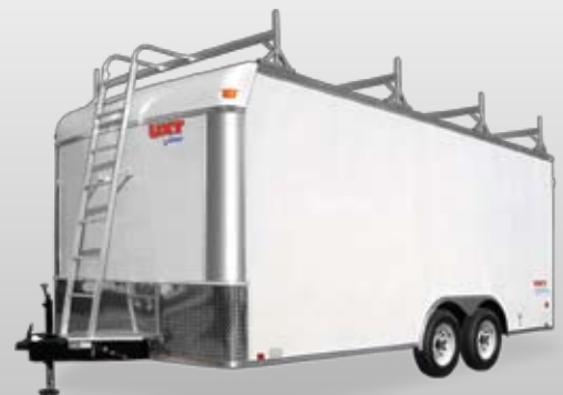
UXT 8.5' x 18' with optional ladder racks and ladder.