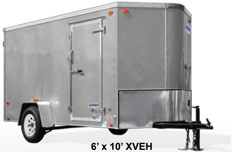
6' x 10' XVEH