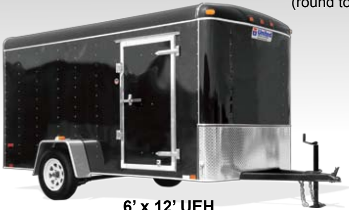
6' x 12' UEH