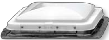
NON-POWERED ROOF VENT