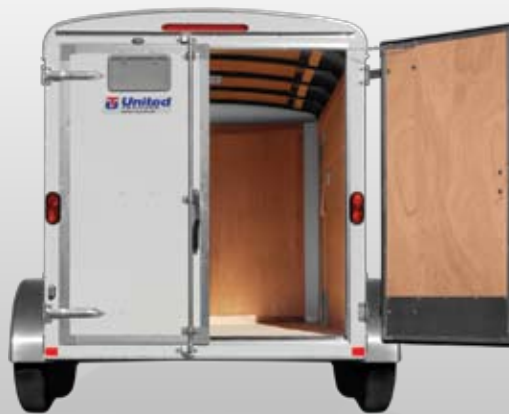
Standard Double Doors