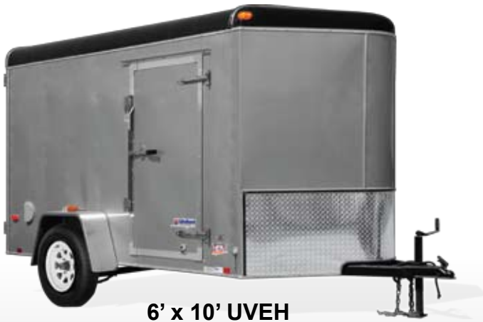
6' x 10' UVEH