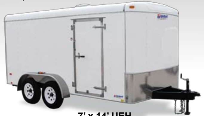
7' x 14' UEH