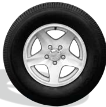
ALUMINUM STAR WHEEL