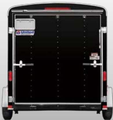
Optional Ramp Door