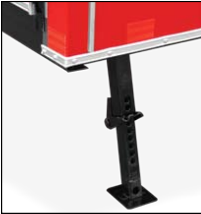
FOLD-DOWN STABILIZER JACK