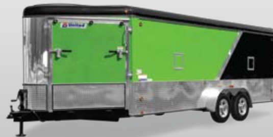
Arctic Green and Black two-tone metal treatment, bright aluminum on the nose, aluminum treadplate on the sides, and star wheels.