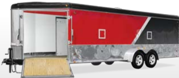
Red and Black two-tone metal treatment, bright aluminum on the sides and nose, and star wheels.