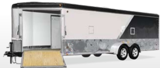
White and Black two-tone metal treatment, bright aluminum on the sides and nose, and star wheels.