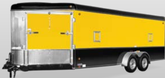
Yellow and Black with bright aluminum on the nose and rear door opening and outlaw wheels.